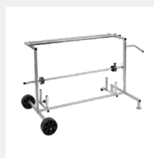
NTools Foil Cart (APP No. 170207) Foil Cart - For masking foil 2in1, 13kg, 1560 x 670 x 800mm