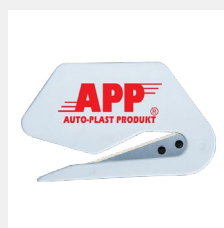
APP F Cut (APP No. 170199, 170200) Masking foil cutter