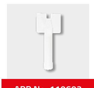
APP No. 110603