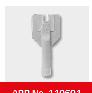
APP No. 110601