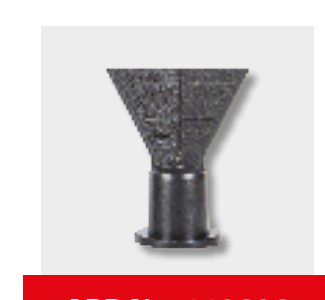
APP No. 110606