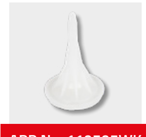
APP No. 110505WK