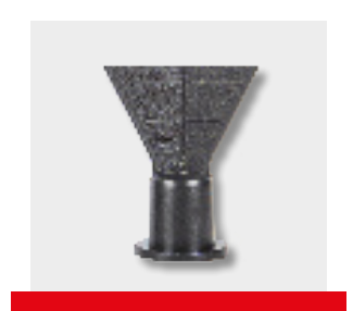
APP No. 110607