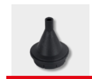
APP No. 110505ZP