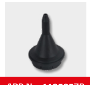
APP No. 110505ZR