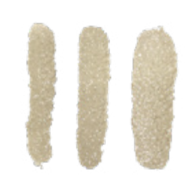
NTools DW short