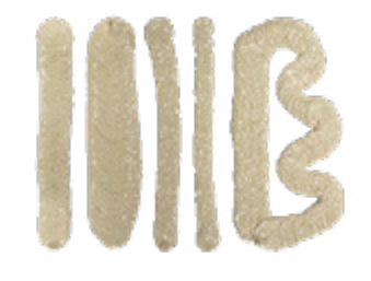
NTools DW intermediate