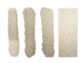
NTools DW long