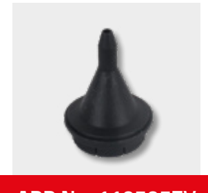
APP No. 110505ZV