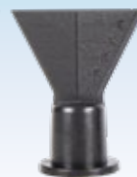
110606 Nozzle made from hard plastic.