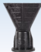
110607 Nozzle made from soft plastic.