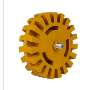
Disk for tape and sticker removal, ø100 mm (APP No. 139936)