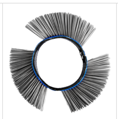
Medium wire wheel brush: Width. 23 mm; 103 mm; wire. 0,5 mm (APP No. 139934)