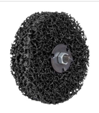
Abrasive disk 100 mm (APP No. 139938)