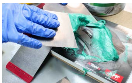
Mixing of putty with curing agent