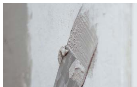
In construction works: plastering, filling.