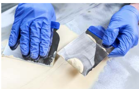
Application of various types of masses.