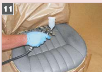
11 Apply the lacquer, firstly a thin layer and next ones average wet. Wait 5-10 min to allow drying or use heat gun to speed up drying. Application of three layers usually restores the original colour, but sometimes more may be necessary. Shading is required in case of spot repairs. Ensure drying.