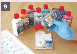
9 Mix components at appropriate ratio using precision scales.