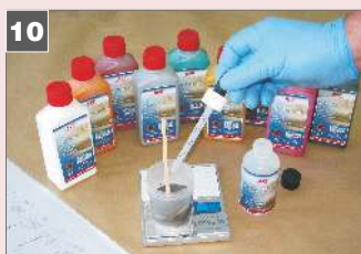
10 When blending add NTW AP preparation to improve resistance to chemicals. In case of standard qty of lacquer add 1.0ml of NTW AP with the attached pipette. On general add ca.3% of NTW AP. Clean the pipette with hot water.