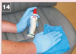
14 In case of leather repairs, following 2-3h after lacquer application, apply Leather Care. For this purpose spray the microfiber cloth and carefully wipe the element.