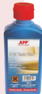
Leather dye, NTW Thalo Blue APP No. 220662