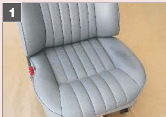
1 Visual examination of damage.