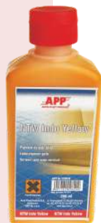
Leather dye, NTW Indo Yellow APP No. 220658