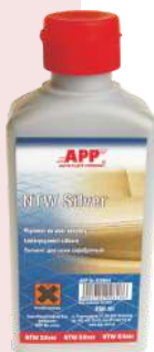
Leather dye, NTW Silver APP No. 220654