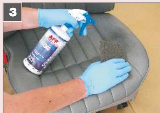
3 Next clean the surface with WK900 Stripper and abrasive fabric to remove the gloss.