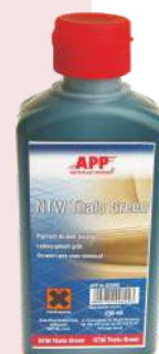
Leather dye, NTW Thalo Green APP No. 220666