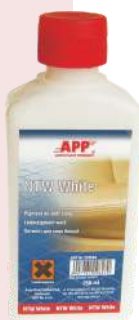
Leather dye, NTW White APP No. 220664