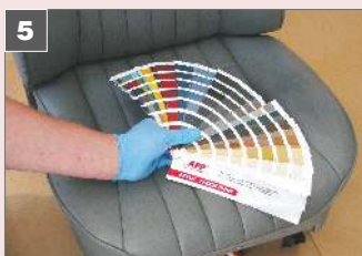
5 Determine the colour with the colour chart. Note that lighting is crucial.