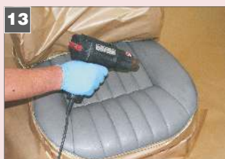
13 After application of the last layer wait 10 min. (dry carefully with heat gun). Do not heat up over 60°C and do not heat up for more than 30 min.