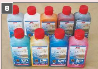
8 NTW Kolor dyes are ready for use. Before application, firstly shake the container. Shaking may result in foaming that does not have any impact on work effects.