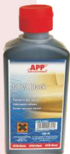
Leather dye, NTW Black APP No. 220652