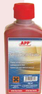
Leather dye, NTW Red Oxide APP No. 220656