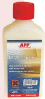
Leather clear dye, matt, NTW L-LUSTER APP No. 220676