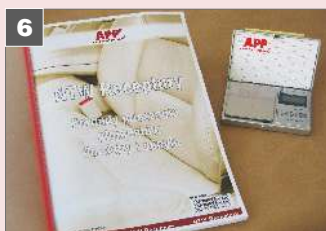
6 Next find the relevant recipe in NTW Recipes on basis of determined colour.