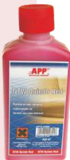
Leather dye, NTW Quindo Red APP No. 220660