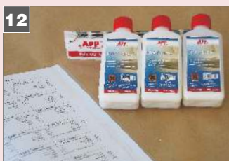
12 Apply the clear lacquer if required in the formula. Also correction may be necessary to ensure proper dulling. For this purpose spray two layers of adequate clear lacquer. NTW L-Luster – mat, NTW S- Gloss - Semi Gloss, NTW G-Gloss- High Gloss.