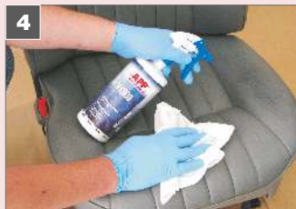
4 Collect any loose particles and clean again with WK900 Stripper and abrasive fabric.