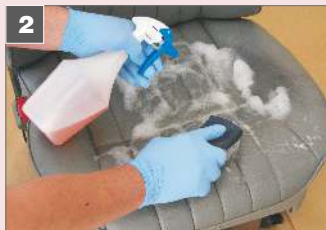
2 Before application of NTW Kolor firstly clean the surface with Cleaner thinned with water at 1: ratio (1:10 for leather) and dry the surface.