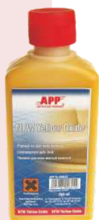
Leather dye, NTW Yellow Oxide APP No. 220670