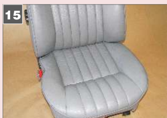
15 Total hardening follows after 24h.