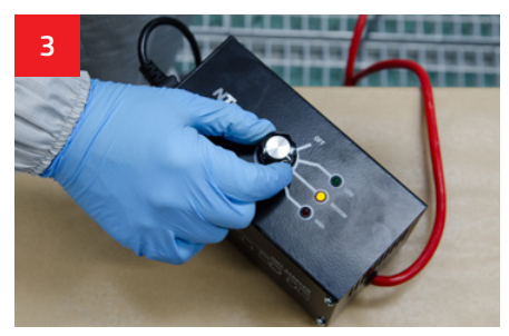
Adjust Hot Stapler temperature: Low, Medium or High.