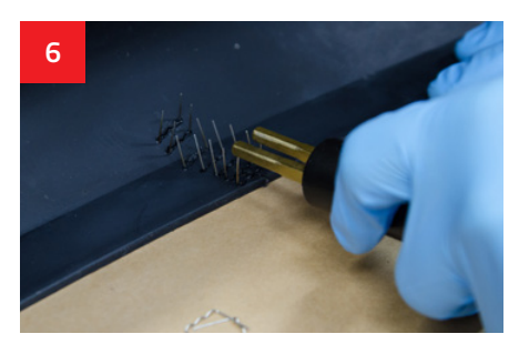
Insert the stapler to repair the damage.