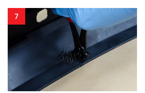
Trim the stapler with the trimmer.