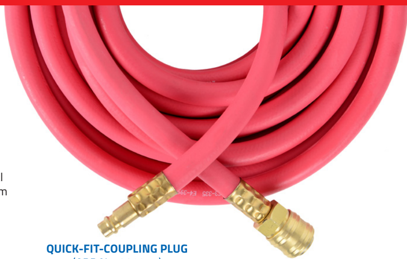
QUICK-FIT-COUPLING PLUG (APP No. 389255)

Ready to use *- fitted with Rectus 26/DN 7.2 high quality brass fittings.